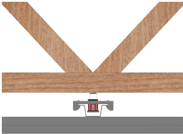
RSIC-SI-X on Open Web Truss