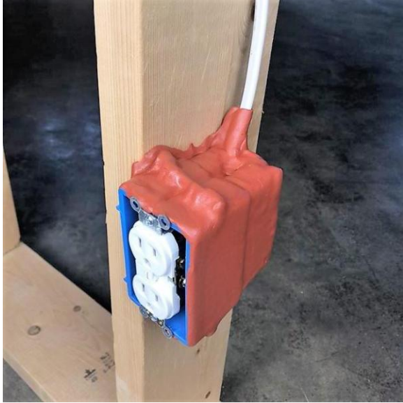
Putty Pad, A Low Cost, High Performance, Noise control Solution